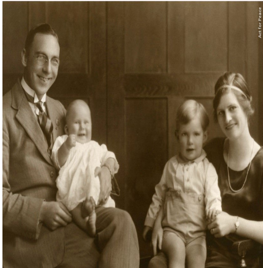
Act for Peace

(Mark 12:31) For 75 years, caring Australians have been giving hope to people forced to flee their homes due to conflict and disasters, through the Christmas Bowl.